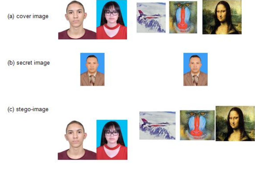
Figure 4. Output of image embedding process: (a) cover image (b) secret image (c) stego-image