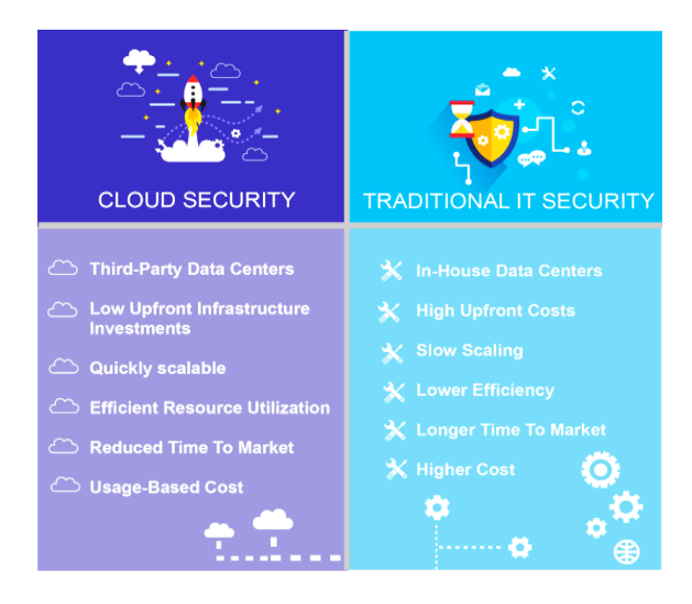
Figure 1. The differences between traditional security and cloud security