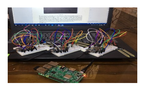
Figure 2. Used hardware components

As mentioned above, we proposed an algorithm to detect, mitigate, and prevent the effect of DoS attack on WSN. This algorithm tests the data received from three nodes by examining the difference of the received time as well as the message size between two consecutive messages within specified thresholds. The first threshold is taken according to the minimum time differences between all the pre-received readings from included nodes, which is 10 seconds. Moreover, the second threshold considers the difference of message size between two selected types of reading messages. We meant by message size is the possible readings range of maximum and minimum values. These thresholds increase the possibility of being such node is a DoS attack. This/these node (s) is/are entered to prediction stage to decided later to be DoS or not. The decision is based on continuing the same crossing of the two thresholds. Figure 3 shows a flow chart of the proposed algorithm, which can be summarized in the following: