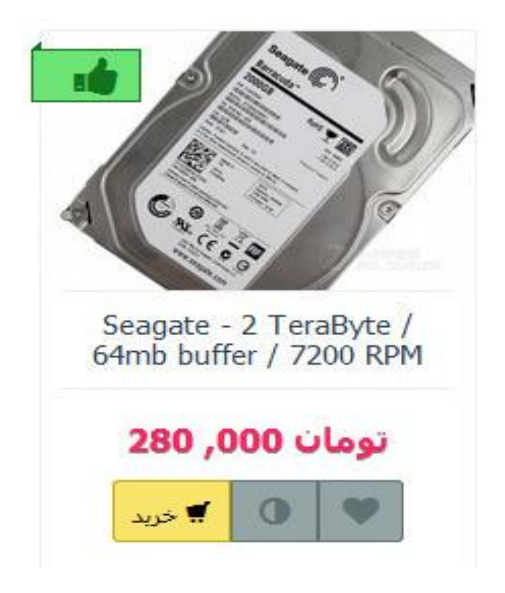
Figure 1. Item Description in Rayan Saba

E-shops are among the most conventional functions of e-commerce. In these shops, users search for goods using keywords or classifications and read the item description provided by sellers. Though when the number of goods is high, it gets difficult for the buyer. On the other hand, the number of e-shops is so high. Browsing in these shops to find the best and most appropriate product is so difficult and time-consuming. On the other hand, item descriptions are not the same in different websites, and there are different templates for the products; for instance, item description in Digikala and Rayan Saba websites is as in Figure 1 and Figure 2.