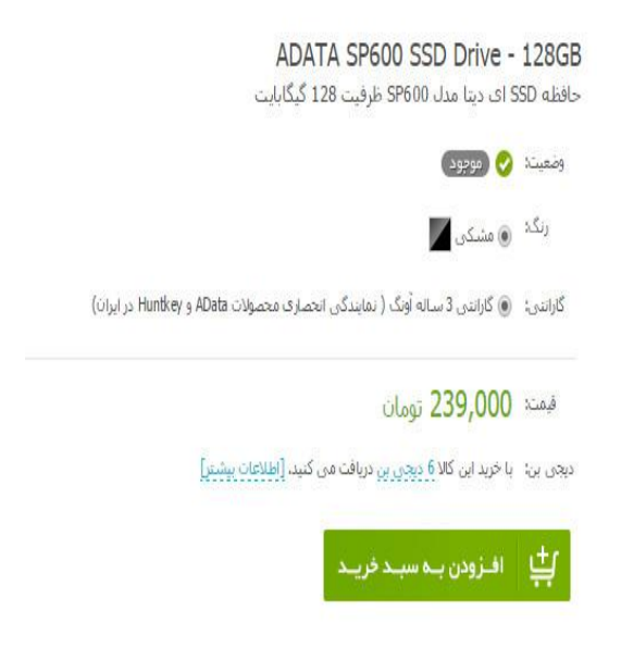
Figure 2. Item Description in Digikala

Item description are presented in various templates in different websites. This study seeks to design an agent to extract information about the required goods from different websites