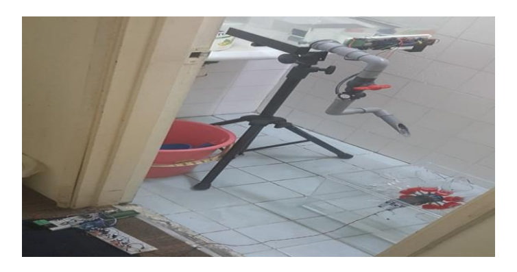
Figure 3. Experimental Setup

To identify the optimum efficiency of the system, 3 test were conducted. The explanation for the each of testing and figures will be shown. Each of the test results will be analyzed by providing data in the form of table and graph. All tests are carried out for the hardware system of the design. Figure 3 displays the experimental setup.