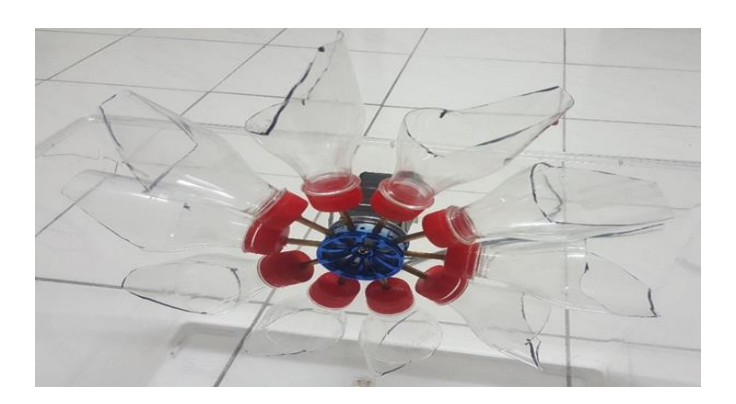
Figure 4. Hardware design of turbine

The generated voltages for each different number of blades were recorded by turning on the ball valve for 100%. The height of the tank is placed at 65 cm and water level in the tank is maintained for all the testing. The designed hardware for the turbine is shown in Figure 4, while the result of the voltage output and number of blades from 2 to 10 blades were recorded in Table 3.