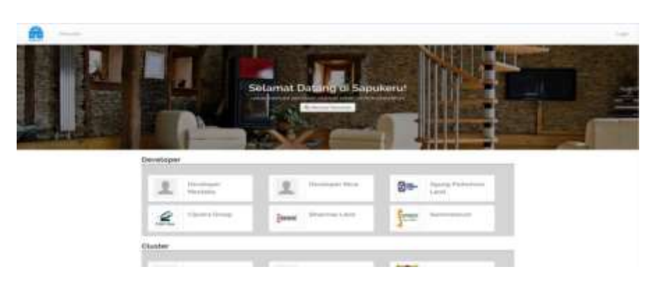
Figure 1. Home Page of sapukeru

In this section, the picture of the web application is shows. The first picture shows home page of Sapukeru. The second page shows the search page of Sapukeru. On this page, the searching progress will be done. User needs to input and select their constraint about choosing the right place. The third page shows the list of the result which suits the requirement. The fourth page shows the detail result which contains the credit plan, facility near by (provided by the developer on database and take from google), the route in google maps, etc.