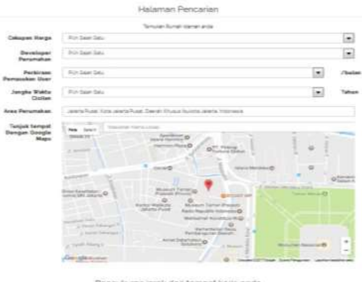
Pengukuran jarak dari tempat kerja anda