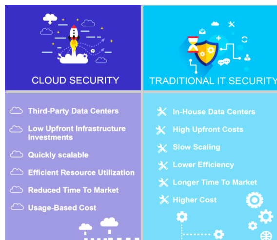
Figure 1. The differences between traditional security and cloud security