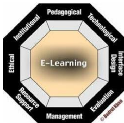
Figure 1. E-Learning Framework (5)

Since the objective of this study was to identify component of social media and knowledge management to enhance learning process, there are some frameworks of e-learning founded from study literature process. One of the famous applicable framework of e-learning according to Khan model, contains eight dimensions (5) Figure 1: Institutional, Technological, Interface, Evaluation, Management, Resource support, Ethical, and Pedagogical,