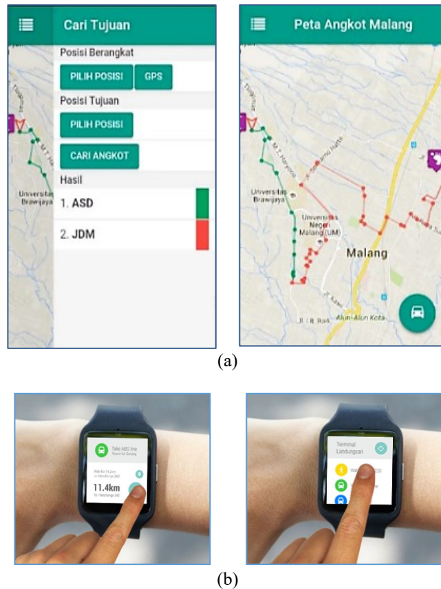
Figure 3. (a) Screenshots of the common smartphone public transit app, (b) The proposed design

Experimental conditions in Figure 3 (a) and Figure 3 (b) show the same task completion with two different application presentations.