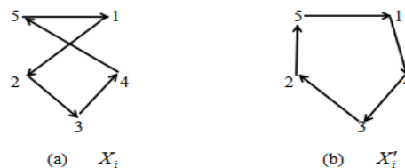
Figure 1. 2-opt neighborhood operation

Example 1. There is a 5-note TSP, solution is X_i = [1,2,3,4,5] as Figure1(a), and we operate side (1,2) and (4,5) based on 2-opt and get neighborhood solution X'_i = [1,4,3,2,5] as Figure 1(b).