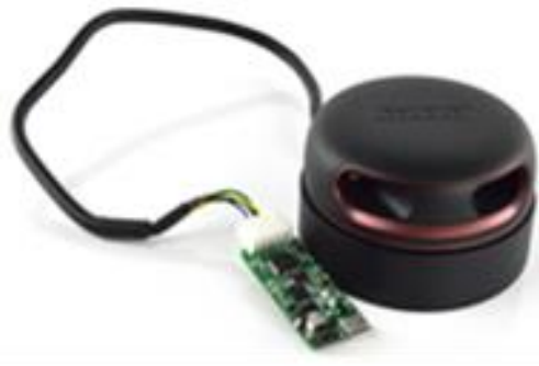
Figure 5. 360 Degree LiDAR

When talking about swarms of UAVs those share common indoor space then the probability of conflict occurrence is high. To resolve this problem, [25] proposed a Conflict Detection and Resolution (CDR) method at Center for Advanced Aerospace Technologies (CATEC). The proposed method where 20 vicon cameras are placed at different locations, not only detect the conflicts by using an algorithm but also resolve the detected conflicts cooperatively using a genetic algorithm which help to modify the trajectories of the UAVs. Their proposed method alters the initial flight plan of each UAV by inserting intermediate waypoints.