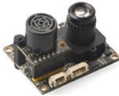
Figure 2. Optical Flow Sensor