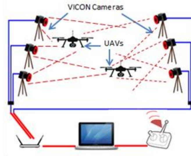
Figure 6. VICON Navigation System

Microsoft's Kinect sensor which is commonly used in xbox products is another option to track indoor navigation is utilized [28] instead of the normal visual sensor for UAV navigation. Kinect sensor allow for visual as well as the depth sensing. Unfortunately, the work is done only for altitude positioning. In another similar work [29], a low resolution kinect camera is used for indoor environment to estimate the position of AR Drone. Firstly, the position was derived from Kinematics and Dynamics of quadcopter which is further provided to the drone model as feedback. Kinect sensor is not only being used for UAV indoor navigation but more common for indoor ground mobile robots. Swarm of UAVs can be a better choice in various applications like search and rescue or where multiple tasks need to complete simultaneously. They can travel above obstacles rapidly; offer elevated sensing as well as parallel task computation and redundancy [30].