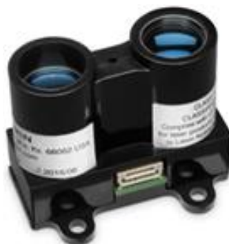
Figure 4. Laser Range Finder

Laser based systems are used for various purposes with different characteristics according to problem and scenario requirements. As in [18] a laser range scanner is used to estimate the UAV position considering the surrounding objects and area. Overall, it is a guidance based technique which use wall-following strategy for the UAV navigation. Similarly, a laser range finder is utilized in [19], where they found that limitations of range finder like limited range and field of view can result to lose the track although not always but in certain configurations and environment. To investigate these limitations authors in [20], used a mirror to test the deflection of laser range finder beams. Although, their results help to improve the distance measurement not only from the obstacles but also from the ground however, still this system offer limited sensor range hence leaving not suitable where precise positioning is required.