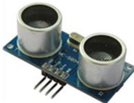
Figure 3. Ultrasonic Sensor

For such scenarios where moderate localization and navigation is sufficient [10] provide a good solution where ultrasonic sensors are used still providing sufficient results for certain applications. Equipping by ultrasonic sensors, at one side it reduces the project cost same time comparatively simple algorithms are needed to implement the system. [11] is another work where three ultrasonic sensors were used to detect any object if found in-front of the mobile robot. They placed two sensors on a side to keep a fixed distance from the wall, hence can a good option to move through thin and long corridors. Similarly, HC-SR04 ultrasonic sensors are used in [12] where Parrot Drone is used while sensors were connected to the data acquisition board Arduino which interprets the received pulses to get the distance in meters. In order to increase the reliability, ultrasonic sensors can be combined with other navigation technologies. One of such effort is done in [13] where authors have merged IMU, ultrasonic sensor and optical flow sensor.