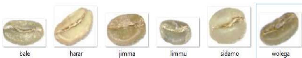
Figure 1. Varieties of Ethiopian coffee beans

To collect the data set, canon EOS 600d camera is used to capture the image. A total of 6 coffee varieties (Bale, Harar, Jimma, Limu, Sidamo and Welega) each having 200 are considered for this study. Once the data set collected, pre-processing and noise filtering steps are performed to achieve the goal of the study through MATLAB, 2014.