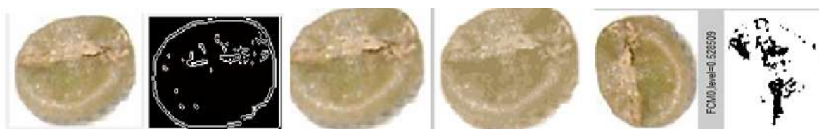
Figure 2. Otsu, K-means and FCM segmentation

The texture based features are calculated using Gray-Level Cooccurrence Matrix (GLCM) from the input. The GLCM calculates the occurrence of a pixel with gray-level value "i" horizontally adjacent to a pixel with the value "j" Every element can be mentioned by (i, j) in GLCM which specifies the number of times that the pixel with a value "j" occurred horizontally adjacent to a pixel with value "i" [18].